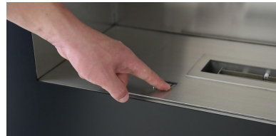
Manual Button Control

Remote control, On/off button control Dry contact for home automation applications & remote control via Smartphone or remote commands