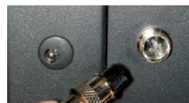
dry contact for home automation