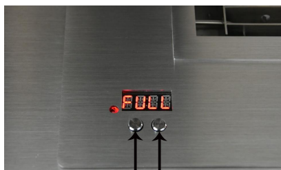
tank opening 2 1 on/off switch